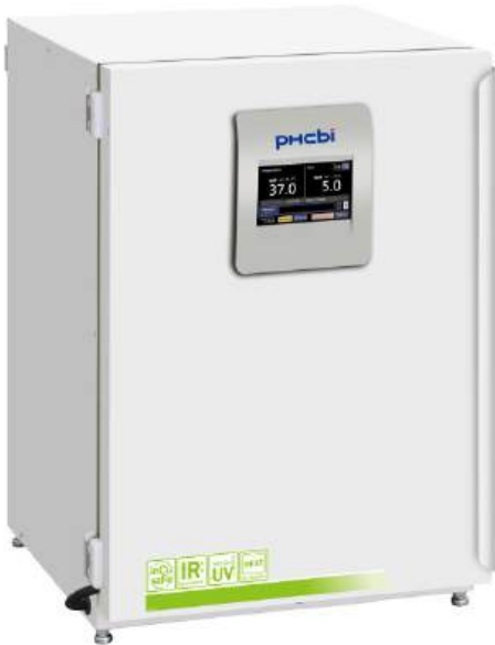
MCO-171AICD / MCO-171AICUVD