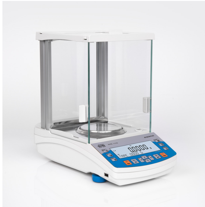
The drawings, photos and graphics used are for illustrative purposes only.