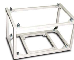
Double Layer Shaking Frame