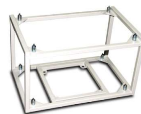
Double Layer Shaking Frame