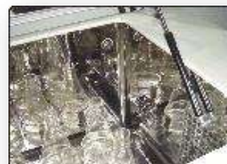
Stainless Steel Inner Chamber with Coved Corners Ensures Easy Cleaning

Advanced Solutions for Scientific Discovery!