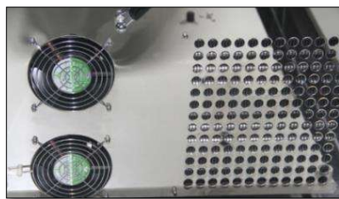
Forced Air Convection Deliver Excellent Temperature Uniformity