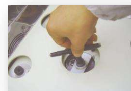
Stepless Shaking Diameter Adjustment