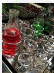
Quality #304 Stainless Steel Inner Chamber