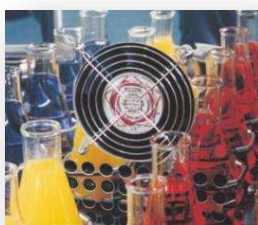
Forced Air Convection Delivers Excellent Temperature Uniformity