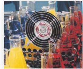
Forced Air Convection