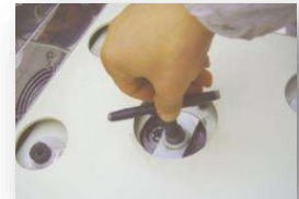
1-50mm Shaking Diameter Adjustment