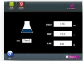
Touch Screen Panel