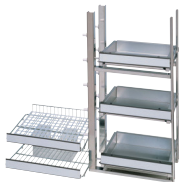
Wire shelves (left), Sliding racks (right)